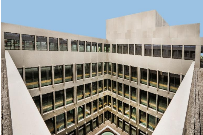
Caption: The Schader building in Zurich