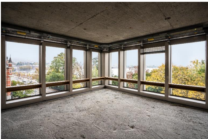
Caption: The upper floors will contain mostly office space.