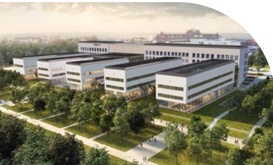
Pomeranian University Hospital Szczecin - Poland Modern clinic, teaching and research centre in Szczecin

The Pomeranian University Hospital in Szczecin will house 16 organizational units including six units of the Center for Translational Medicine, four units of the Collegium Pharmaceuticum and five units of the Independent Clinical Hospital No. 1 in Szczecin on an impressive 49,000 square metres, the equivalent of seven soccer pitches. In addition, the building will house 49 teaching and lecture rooms, including an auditorium with more than 400 seats, laboratories, outpatient clinics and an underground parking garage with around 600 parking spaces.