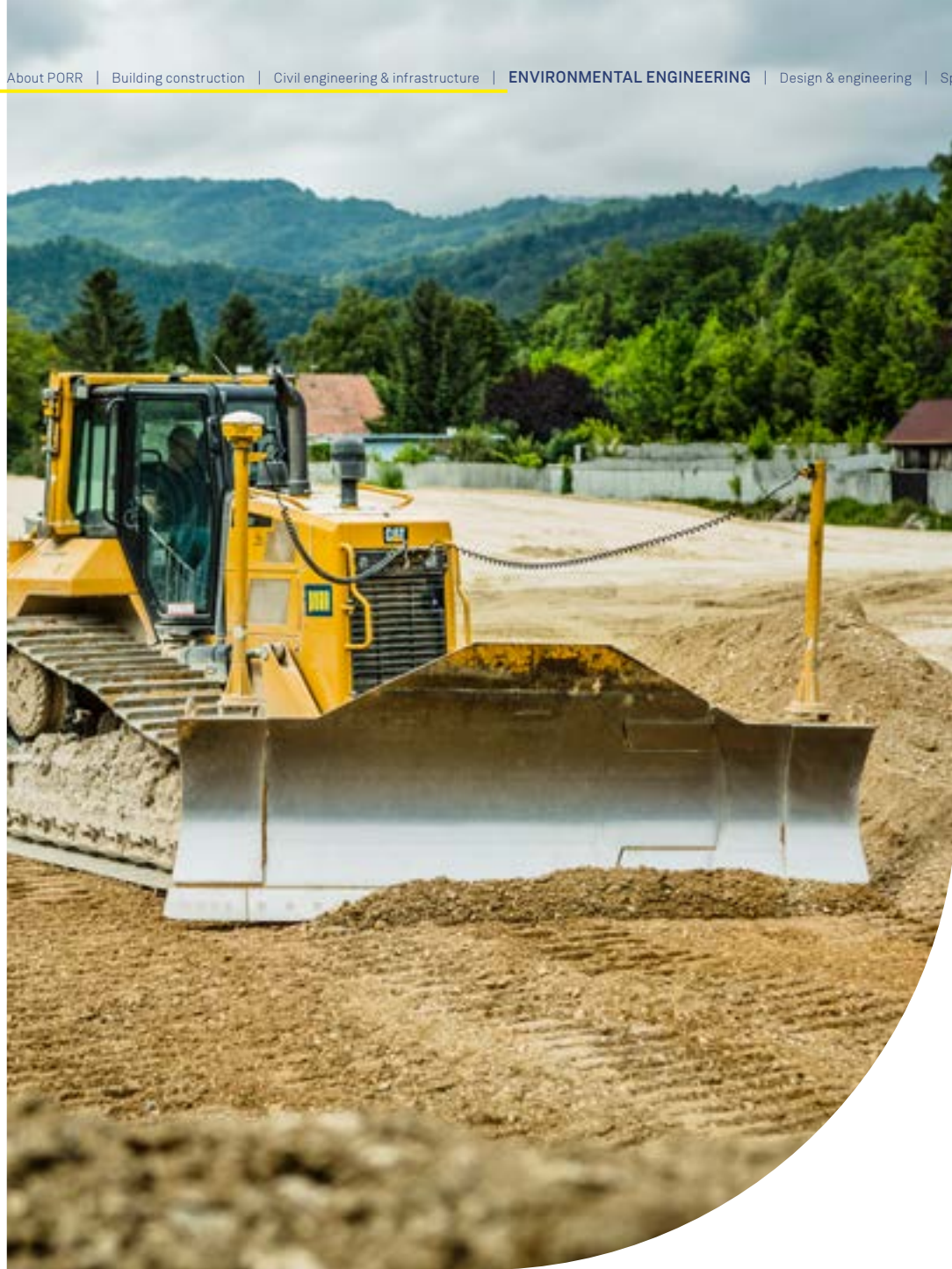
Flood retention basin Fahrafeld/Lower Austria – Austria Earthworks at the largest retention basin in Lower Austria