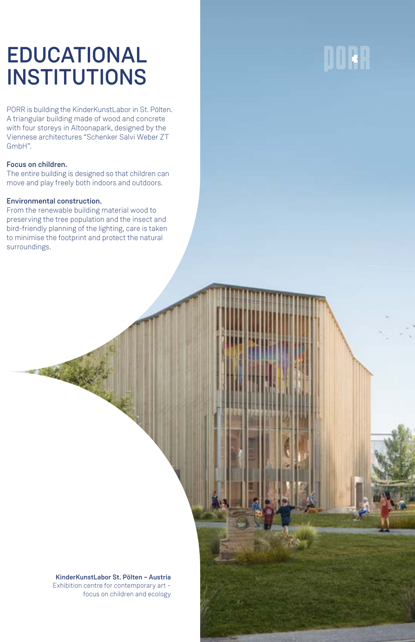
KinderKunstLabor St. Pölten – Austria Exhibition centre for contemporary art – focus on children and ecology

From the renewable building material wood to preserving the tree population and the insect and bird-friendly planning of the lighting, care is taken to minimise the footprint and protect the natural surroundings.