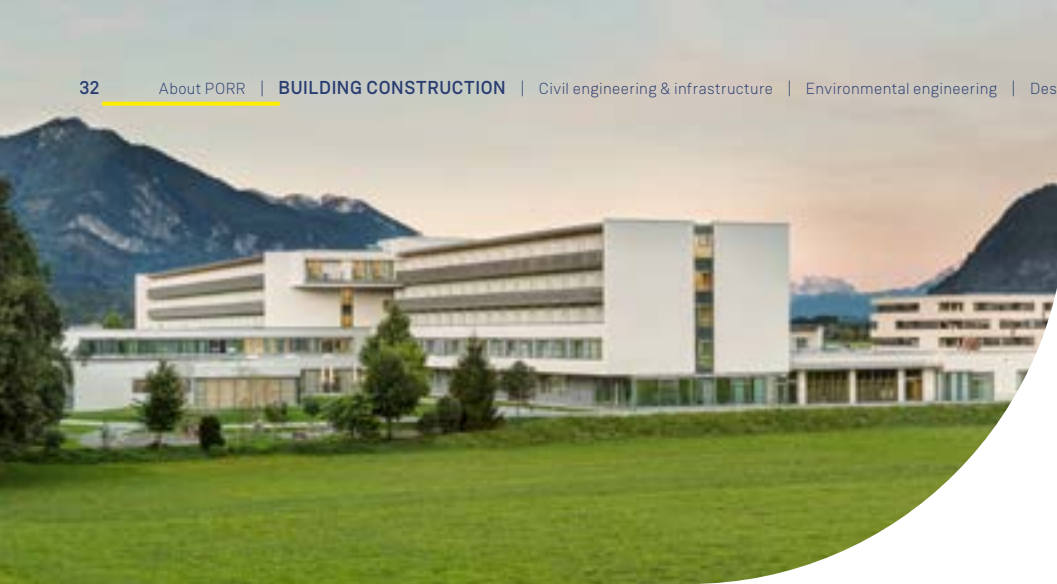
Rehabilitation centre Münster – Austria Austria's most modern rehab centre in Tyrol