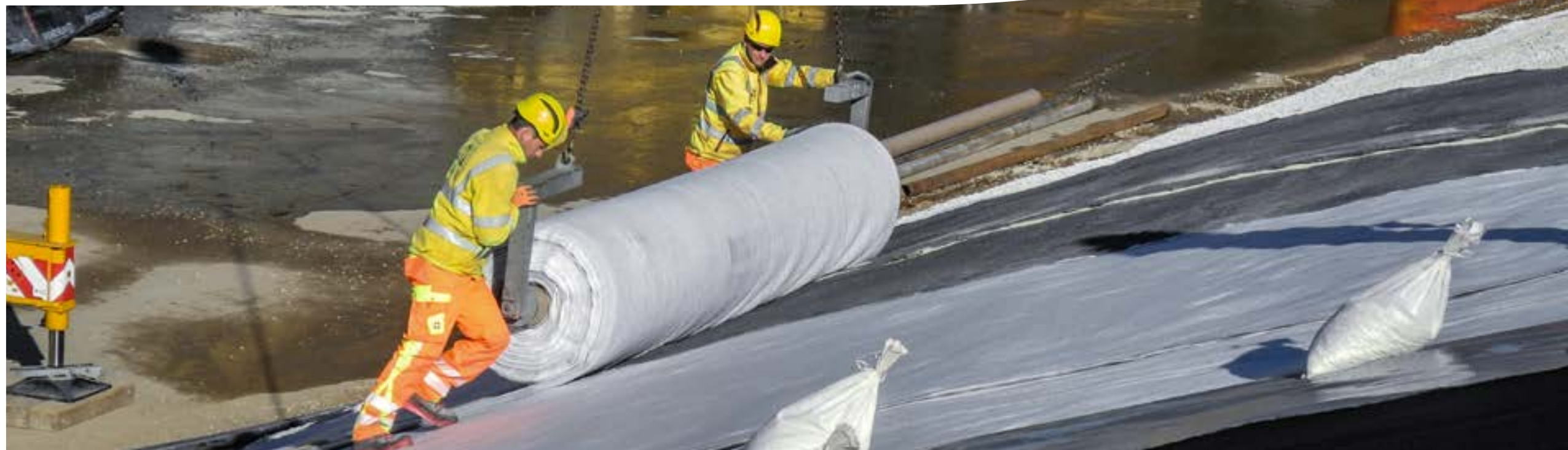
Remediation of contaminated site K20 in Brückl/Carinthia – Austria Safe long-term handling of hazardous substances

The remediation of the K20 contaminated site in the Carinthian market town of Brückl demonstrates PORR's broad range of services in the field of environmental cleanup. The blue lime landfill was long regarded as one of the most dangerously contaminated sites in the country and was made safe by PORR Umwelttechnik GmbH (clearing, loading, disposal, drilling and earthworks as well as the construction of parts of the groundwater purification plant and the soil vapour extraction system). PORR Bau GmbH was responsible for constructing the enclosing diaphragm sealing wall to secure the contaminated site and PORR subsidiary IAT GmbH was responsible for the multifunctional surface sealing. Today, thanks to PORR, the air and water in Brückl are once again free of pollutants.