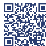
LEAN weekly planning Streamlined processes and increased value add with the LEAN method