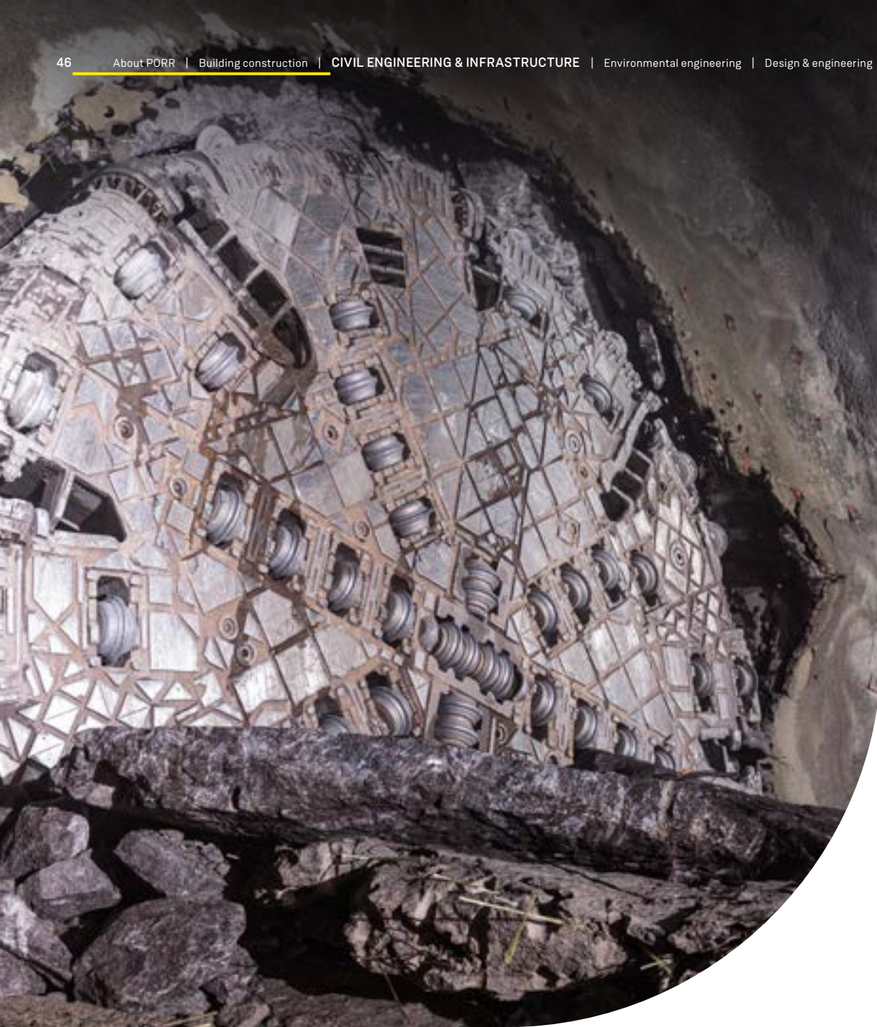
Drill head of a tunnel boring machine